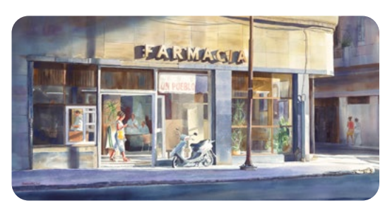
"Havana Pharmacy" by Tony Armendariz

In 2020, Armendariz painted "Modern Man," another watercolor inspired by a Black man. The artist copies the tightly wound expression on the man's