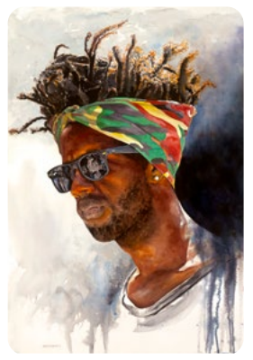
"Modern Man" by Tony Armendariz

In 2020, Armendariz painted "Modern Man," another watercolor inspired by a Black man. The artist copies the tightly wound expression on the man's