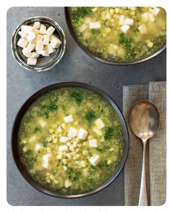
Corn Soup With Queso Fresco (Sopa de Esquites Con Queso)