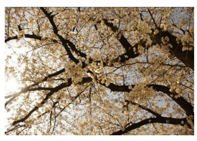
GA-28 - Japanese Cherry Blossom 1