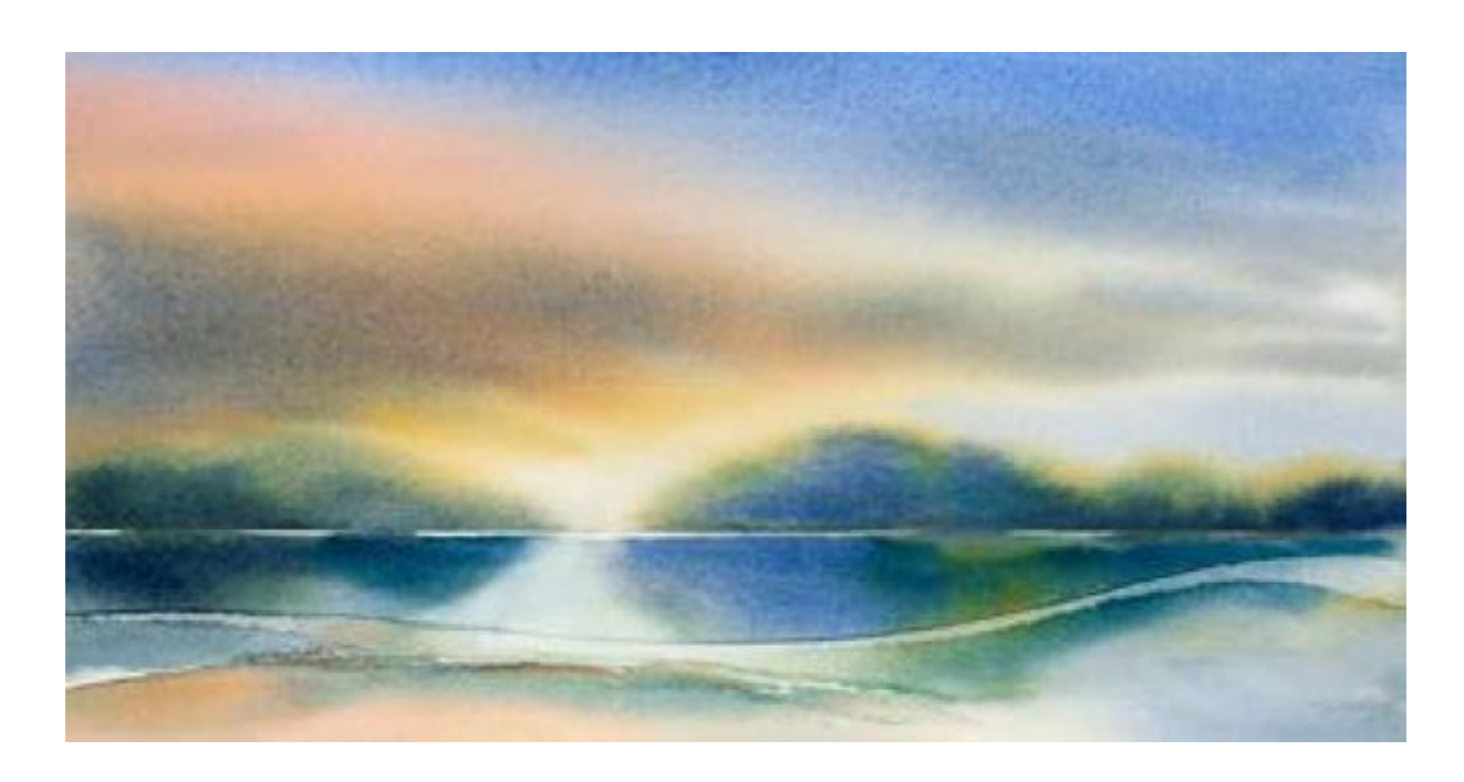
GA-15 - Water Ways 2