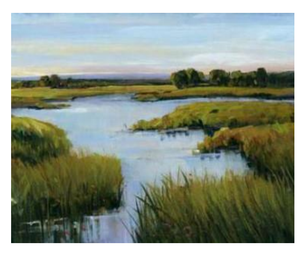
GA-7 - At The Edge I