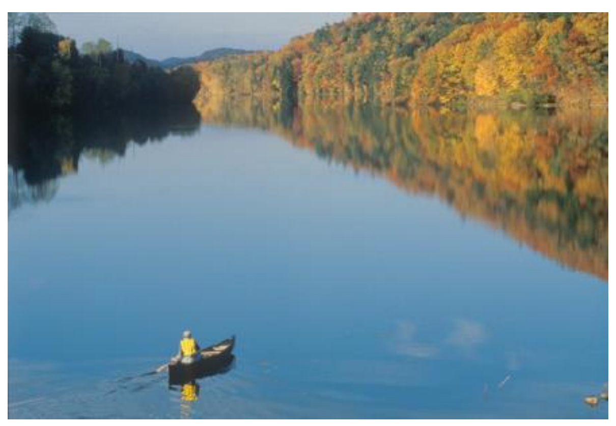
GA-2 - Person Canoeing On Connecticut River In Autumn