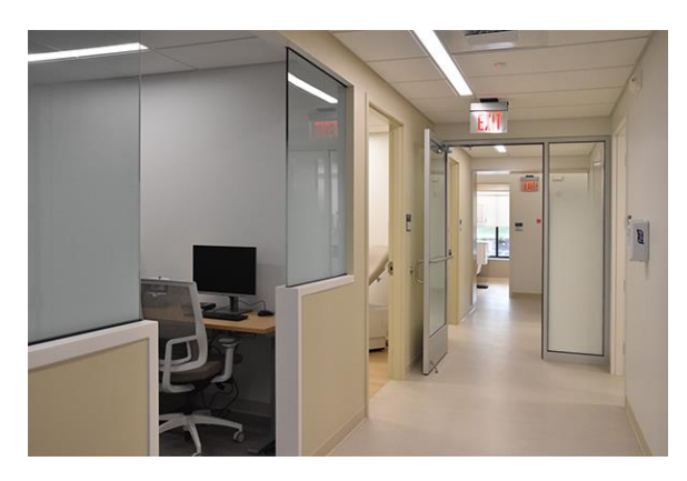
B - Clinic Corridor