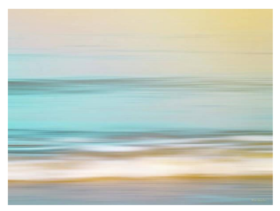
FA-14 - Smooth Watercolors