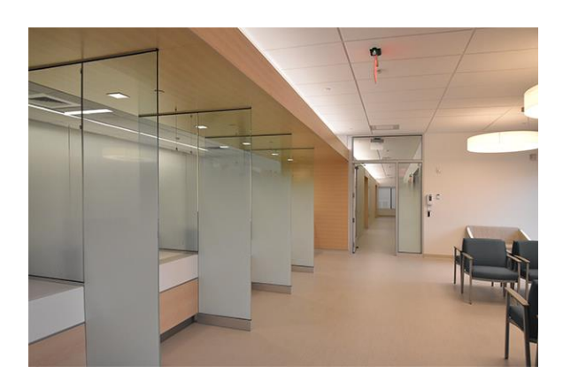
A - Waiting to Clinic Corridor