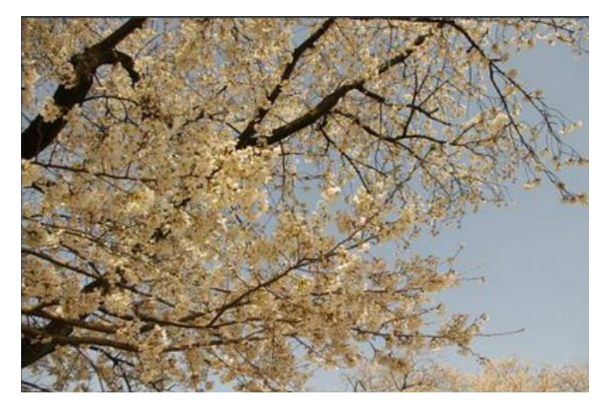
GA-29 - Japanese Cherry Blossom II