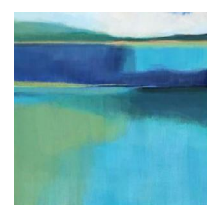
GA-20 - Lagoon II