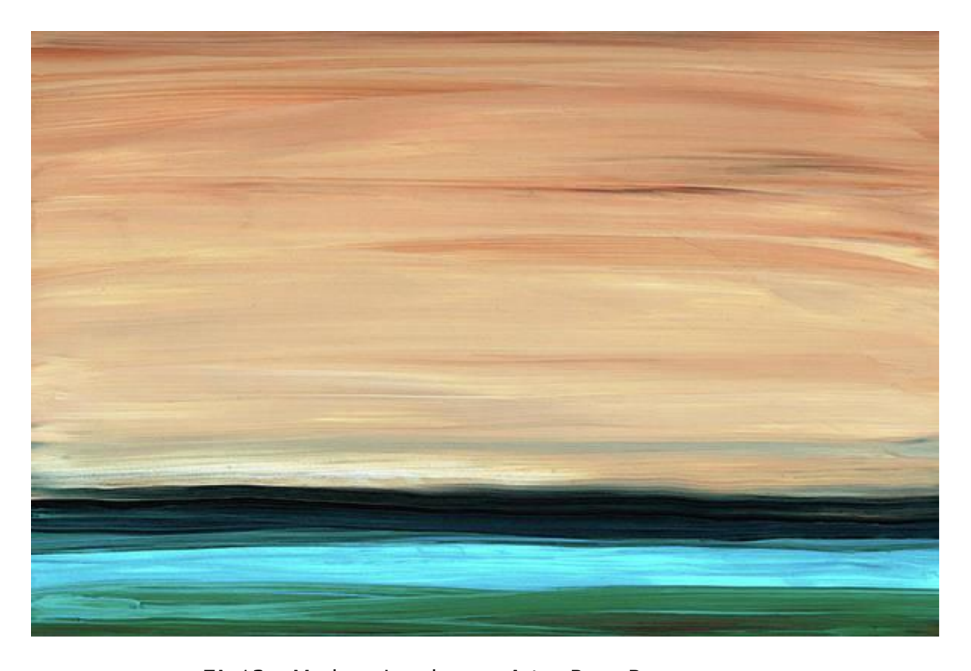
FA-12 - Modern Landscape Art - Pure Peace