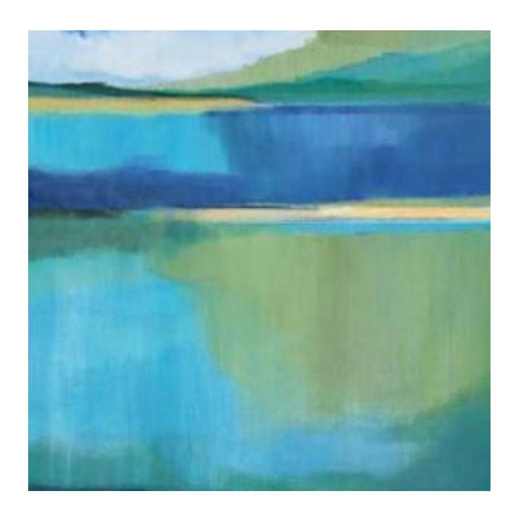
GA-19 - Lagoon I