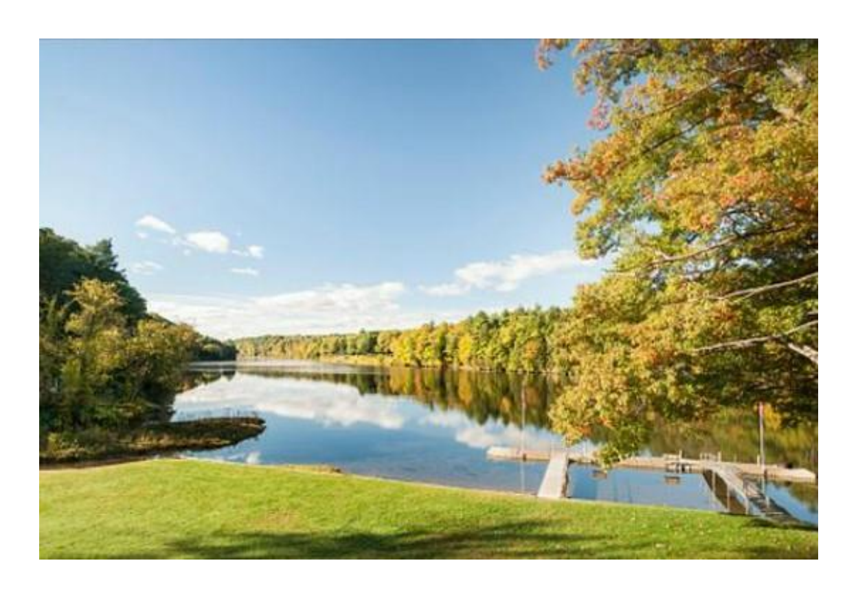
GA-5 - Connecticut River, Morning Calm And Fall Colors