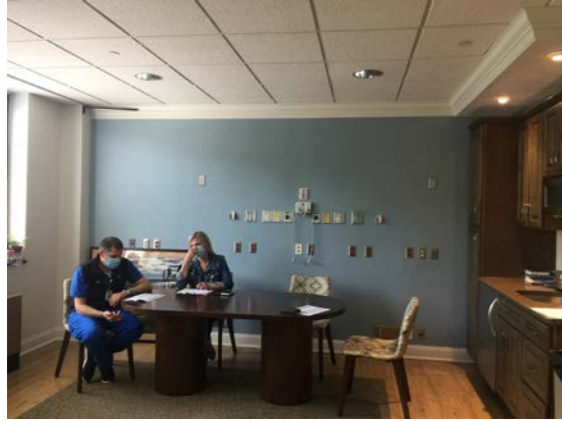
Location 1 wall-Art size; 94" w x 46" h