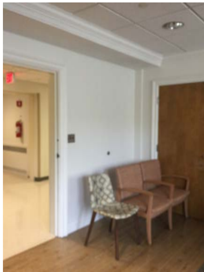
Location 2 wall-Art size; 41" w x 31" h