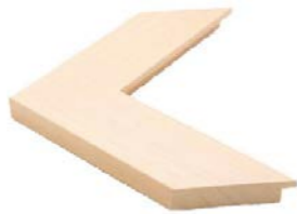
2 1/4" Natural Wood Frame