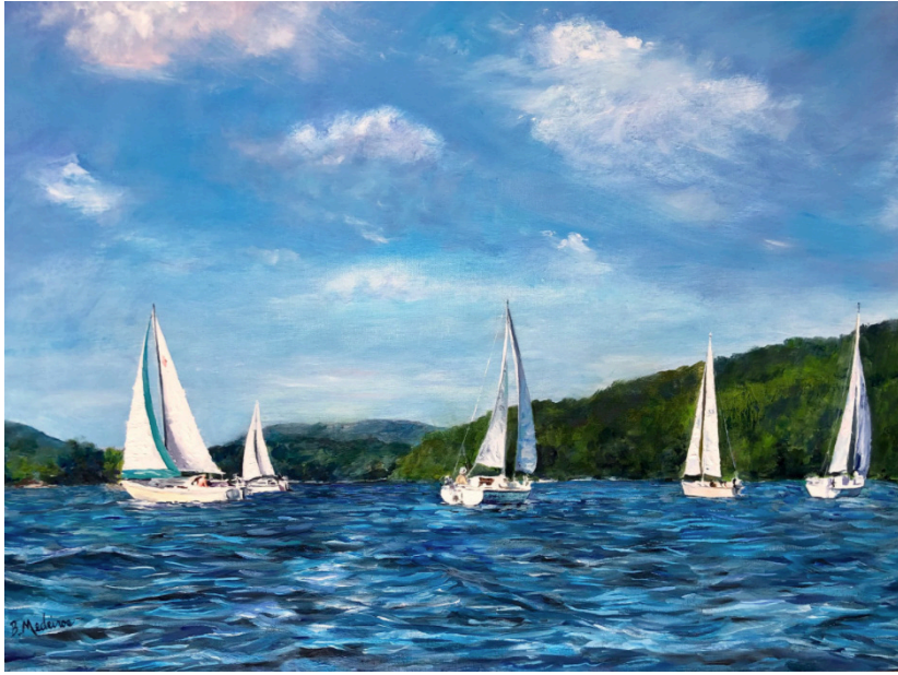
15 Local artist