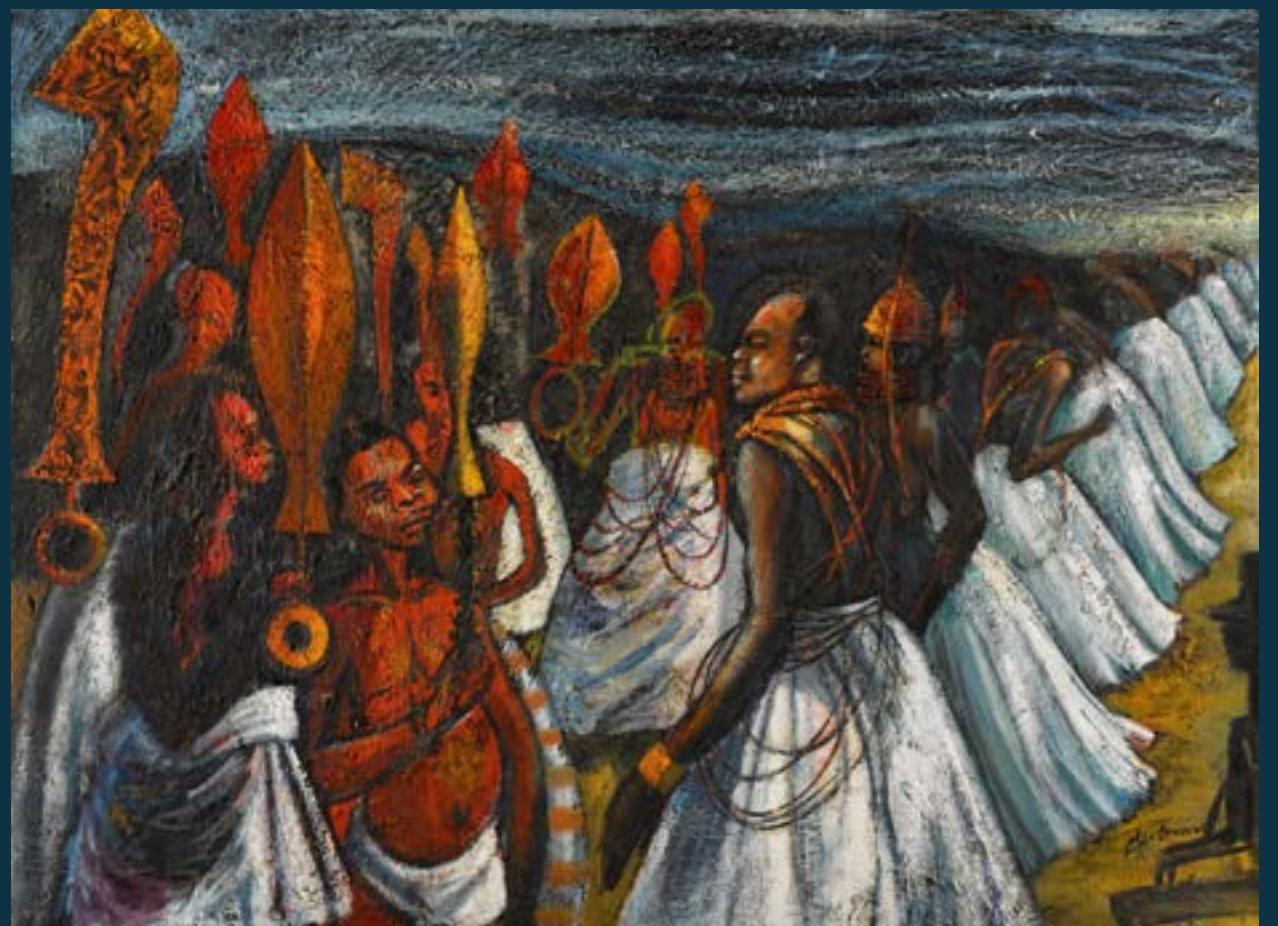
The Court of the Oba of Benin by Ben Enwonwu