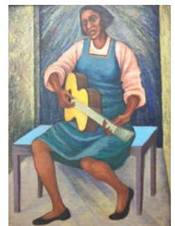
Woman with Guitar, Elizabeth Catlett