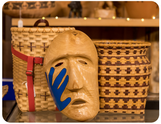
Billy Welch creates masks representing the Seven Clans of the Cherokee including Blue, pictured above.

The masks Welch creates represent the Seven Clans of the Cherokee: Bird, Blue, Deer, Long Hair, Paint, Wild Potato and Wolf. The colors on the masks correspond to each clan. "They're (the masks)